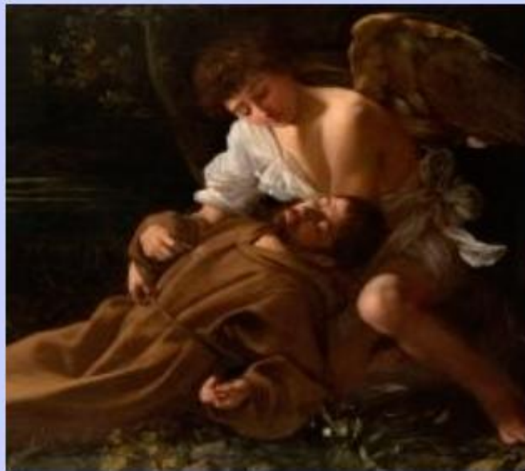
St. Francis Assisi in Ecstasy, Michelangelo Merisi da Caravaggio, 1595

Robert Maplethorpe: XYZ Drawing Surrealism Daily Pleasure: French Ceramics Walter deMaria: Sculpture Ed Ruscha Ken Price Sculpture Michael Heizer: Actual Size Stanley Kubrick Levitated Mass